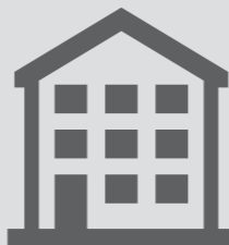
Higher stamp duty