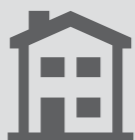
Average price of a home bought under help to buy