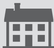
Average family home