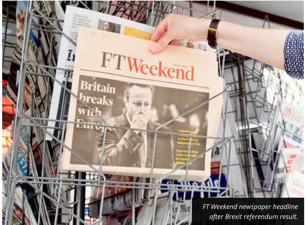
FT Weekend newspaper headline after Brexit referendum result.

Looking towards the future, diversification will help protect investments from the full impact of market volatility, but it's important that investors don't over-worry about disruptive events or financial crises that are unlikely to happen and play it too safe in their asset allocation.